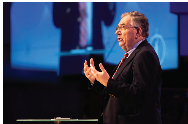
Sinclair Ferguson speaks at the Kingdom Come Conference