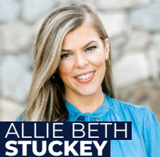
ALLIE BETH STUCKEY