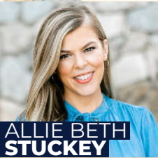
ALLIE BETH STUCKEY